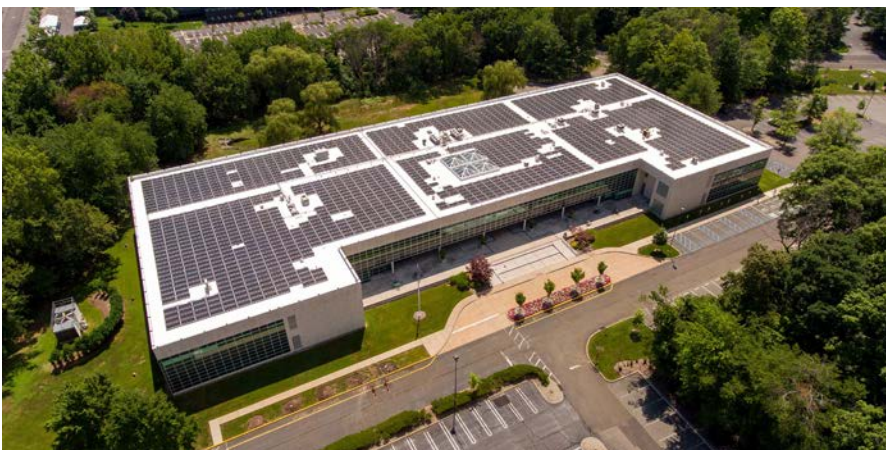
New Solar Rooftop Panels